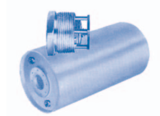
Two DFT Vacuum Breakers used in a "dry can".

DFT® Vacuum Breakers provide effective protection against collapse of pressure vessels, tanks and rolls. They prevent condensate "back-up" when equipment is shut down or inlet steam is reduced by modulating control valves. In piping systems, DFT Vacuum Breakers are used to break siphons, prevent pipe collapse during transient pressure drops, and to provide addition of air on the downstream side of check valves to dampen water hammer.